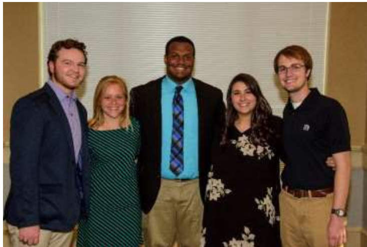
2016-2017 SGA Executive Officers

Student Government Association SGA meets weekly in Spruill Ballroom ○ Tuesdays at 7:00 p.m.